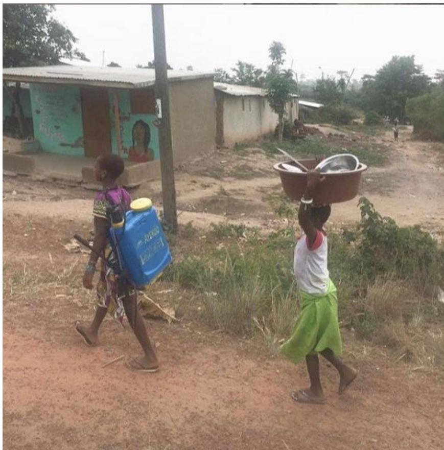
Child laborer carrying pesticides on his back to spray on cocoa crops

6 81. Greenwashing in its own right can be an extremely misleading and 7 oftentimes harmful practice. In Nestlé's case, its actions have perpetuated and funded 8 child slave labor. Nestlé represents that its products not only support sustainable 9 farming practices but provide other general environmental and social benefits. This is 10 difficult to reconcile with the fact that Nestlé actively exploits child slaves in order to 11 obtain an ongoing, cheap supply of cocoa. Nestlé maintains exclusive supplier/buyer 12 relationships with local farms and/or farmer cooperatives in Côte d'Ivoire and dictates 13 the terms by which such farms produce and supply cocoa to them, including 14 specifically the labor conditions under which the beans are produced.